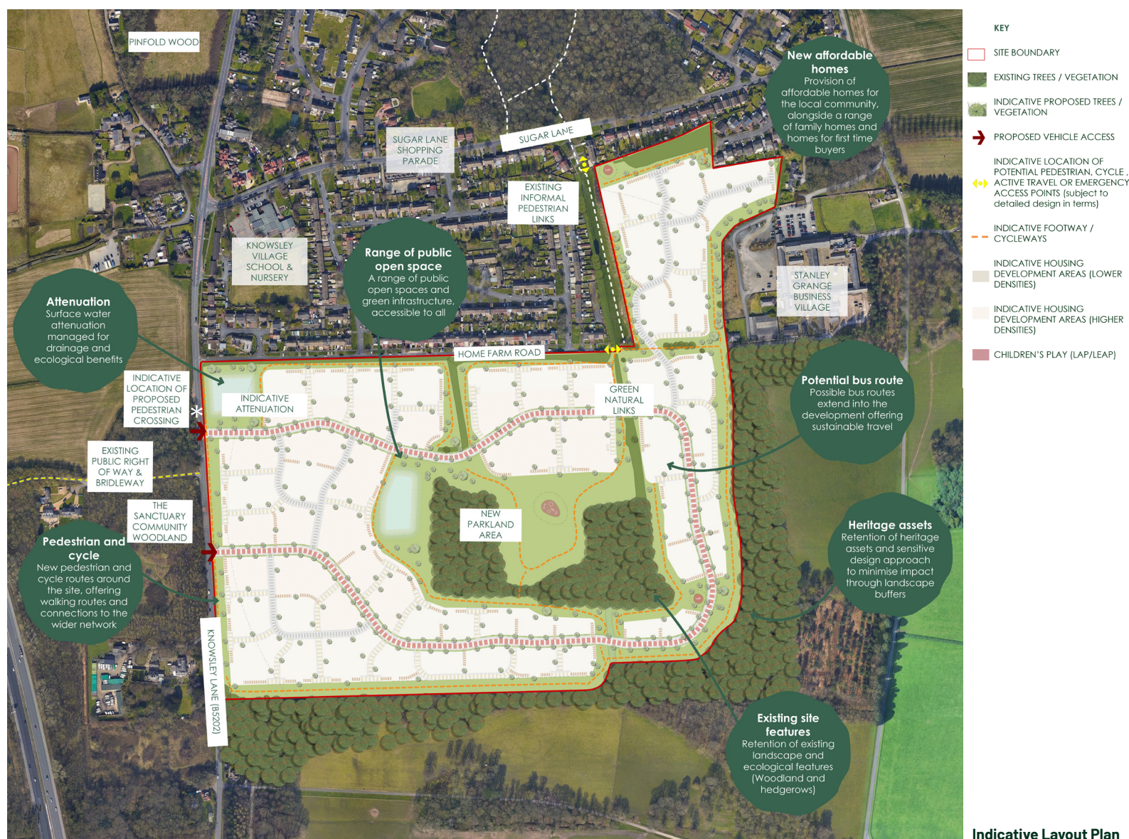
Indicative Layout Plan

The proposals include up to 750 new homes, including affordable homes for the local community, a large central parkland area, integrated green, pedestrian and cycle links as well as a potential new bus loop; with these key design principles shown on the plan below.